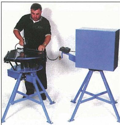
UK Swift Shop Production System

Its now 5 years since Edgetech came ashore in Great Britain, setting up its own sales and distribution company in the Midlands to introduce, market and deliver Super Spacer® ® , produced far away in the USA at the company's Cambridge, Ohio plant (see centerfold).