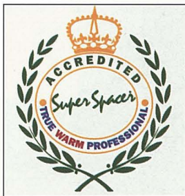
True Warm™ Professional Logo